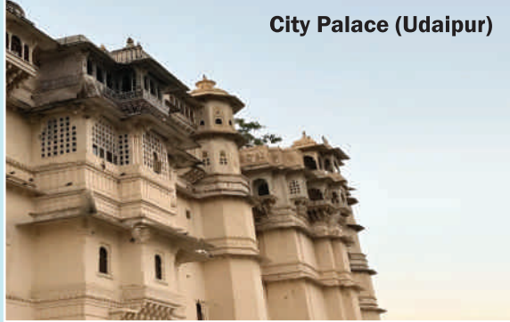
City Palace (Udaipur)