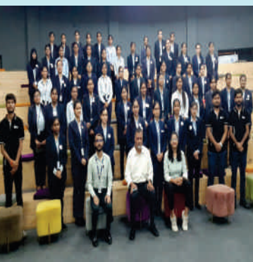
RNTU (Atal Incubation Center)