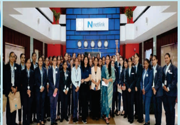
Netlink Software Pvt. Ltd.