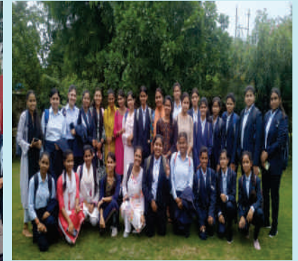
Netlink Software Pvt. Ltd.