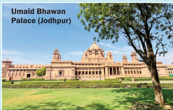
Umaid Bhawan Palace (Jodhpur)