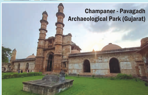
Champaner - Pavagadh Archaeological Park (Gujarat)