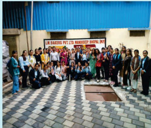
LM Bakers (Parle G)