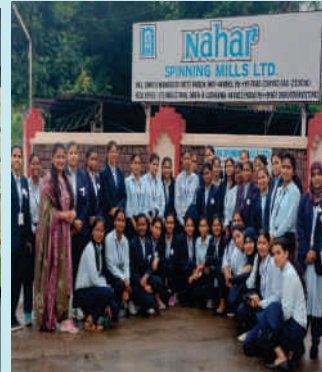
Nahar Spinning Mills Ltd.