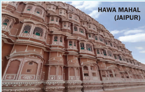
HAWA MAHAL (JAIPUR)