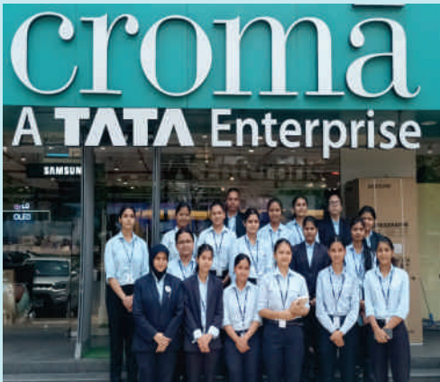
CROMA - (A TATA Enterprise)

The SHIM Placement Cell arranged Industrial visits for BBA, Integrated MBA and MBA students to enhance practical industry exposure across sectors like retail, IT, and manufacturing, bridging the gap between theory and real-world business.